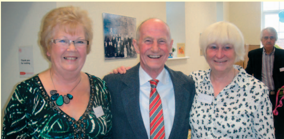
Ellington Village Hall

Three years ago Northumberland County Council made the decision to close our library in Ellington. The Parish council held a public meeting and from this, a committee was formed to save the building which is 173 years old and is a focal point of the village. After talks with County Library it was decided that volunteers would be trained to run the building as a Village Hall and continue the library service.