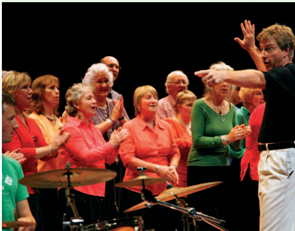
20,000 voices - Gospel Choir Queen's Hall

20,000 Voices is a charitable company based at Newbiggin Community Arts Centre. Originally a 3 year project set up by the Mid-NAG, it became independent in 1997 and has provided opportunities for over 133,000 Voices.