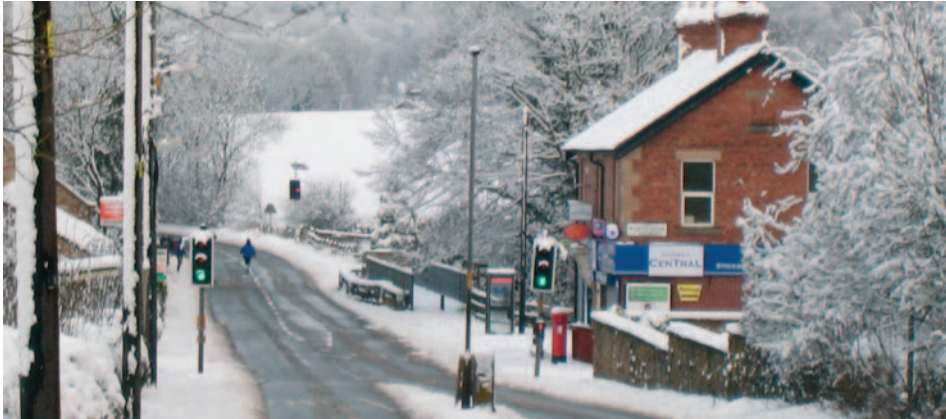
Stocksfield

One of the early issues identified by the recently established Northumberland Strategic Partnership (NSP) Broadband Task Group was the need for local intelligence on which areas of the county experience problems with broadband access. Although maps are published which identify areas which can or cannot receive a service, the networks do not always perform as expected which means the reality on the ground does not always equate to the broadband providers' maps. Therefore it was proposed to survey users in order to identify gaps and areas of the county with slow broadband services.