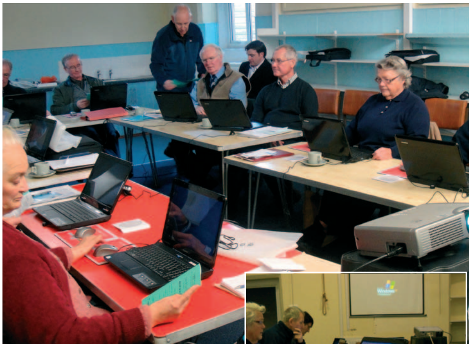
Training at Chatton Village Hall

The perennial chore of producing the year end accounts for the annual meeting has been banished for ever! No more searching for the treasurer under a mountain of paper! The BOSS Project's 'Easy Accounts' training has already set free two dozen community group treasurers who have mastered (in less than an hour!) a simple computer programme which produces the annual statement of accounts in 30 seconds! Unbelievable? Read on!