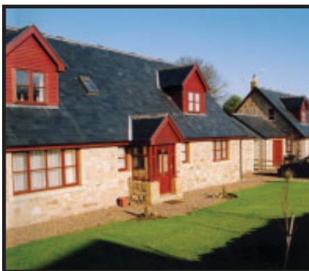
New housing at Crookham

There is a broad range of housing available in the Parish. The vast majority of housing stock is owned by the two major landowners and rented out to tenants, resulting in a rather lower age profile than may be found in similar rural parishes where the majority of housing is owner-occupied.