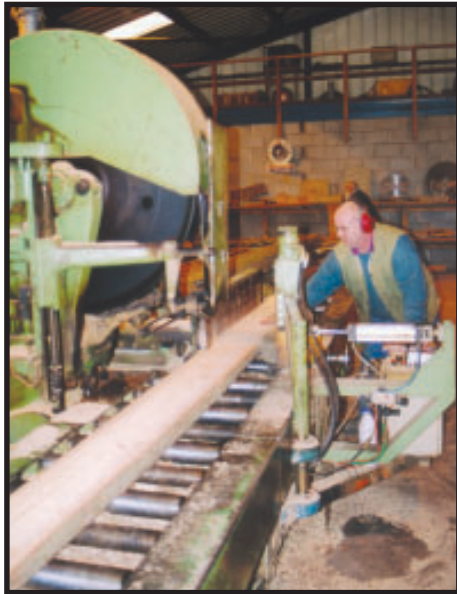
The Estate Sawmill

Approximately 1,000 acres were felled during the Second World War; the subsequent postwar plantings are now approaching maturity. Much of the woodland was originally planted for shelter, sporting and amenity purposes with some of the larger blocks being commercially viable. This is still the case.