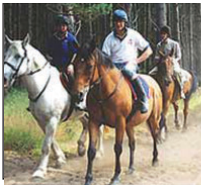
Riding in the woods of Ford Parish