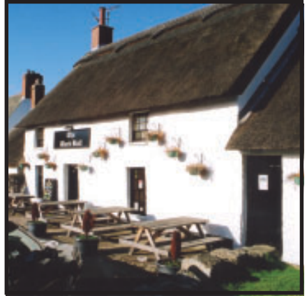
The Black Bull, Etal

The village has an historic small Church of England church within the grounds of Etal Manor which is used for worship during the winter months, alternating with Ford Church (see p. 3). There is a public telephone box, and a village hall, which has a computer room with fast access to the internet. The village hall requires some updating to comply with disabled access regulations. There is a cricket club and ground.