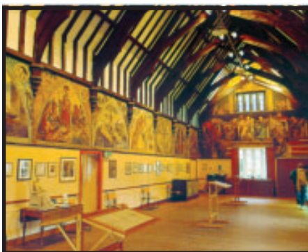
Lady Waterford Hall

The Hugh Joicey Church of England Aided First School is the only school in the parish. It currently has two classes, a total of approx. 35 children. Ford is 'an estate village' and has a Church of England church and churchyard, a combined shop and Post Office, a public telephone box and there are public toilets (open March to October).