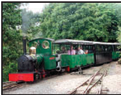
Heatherslaw Light Railway

visitors who come year after year. Many others are day visitors