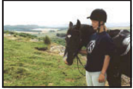
Riding on Ford Moss

The villages of the Parish of Ford are at the “heart” of the Ford and Etal Estates, owned since 1908 by the Joicey family, a traditional agricultural estate of 6,000 hectares (15,000 acres) comprising tenanted and ‘in-hand’ farms. The villages themselves were once, like countless other villages, exclusively places where almost all the residents were employed on the estate itself, but times have changed as a result of many developments.