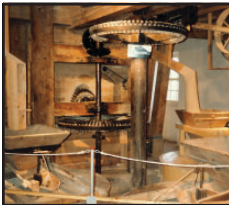
Heatherslaw Water Mill

Several houses and a farm lie on a narrow C road which crosses the River Till at Heatherslaw over an iron bridge with weight and width restrictions, and which itself is a listed building structure.