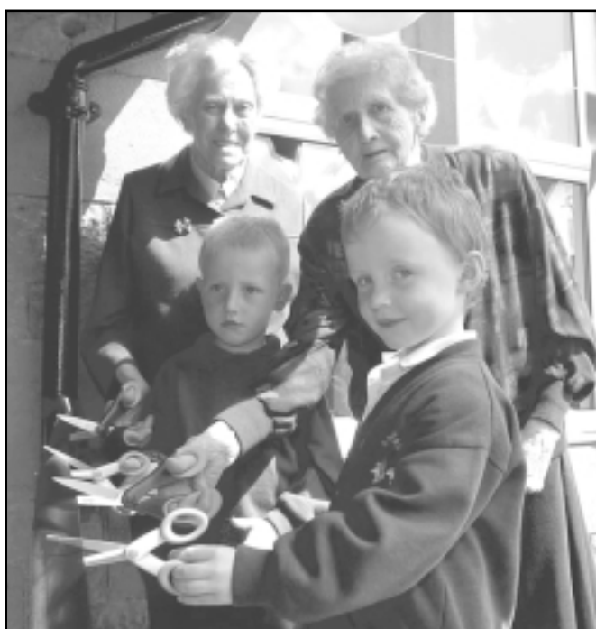
Cutting the ribbon to officially open the new extension

For four years we set out to make our cold damp gloomy hall with its sink (cold tap) in the corner, and dreadful outside loo, the place to be. We got grants for an immediate refurbishment - re-plastering, rewiring, good heaters, hot water, etc and at the same time we ran as many events, training session etc.