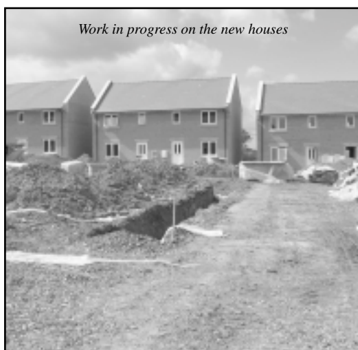
Work in progress on the new houses