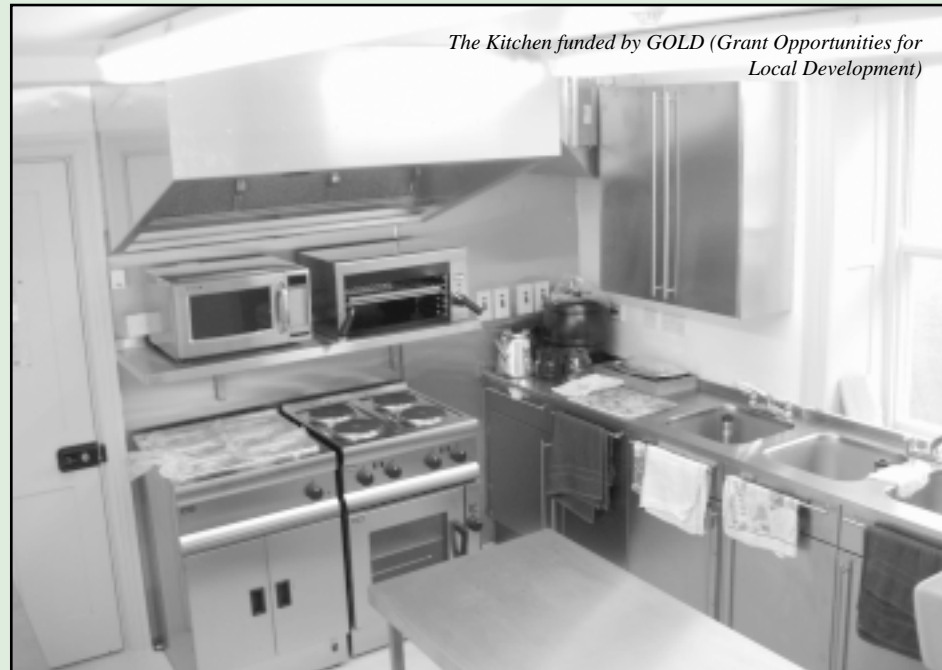
The Kitchen funded by GOLD (Grant Opportunities for Local Development)

village and provide space for a wide range of activities. The building work and restoration is almost complete and has been supported by many local people and organisations. Much of the finance has been raised locally with about one third coming from grants such as Objective 2, Leader + Entrust, GOLD, NCC and Vital Villages.