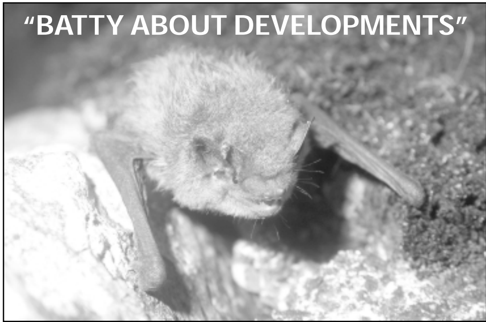
The Pipistrelle bat is common in the Northumberland area

IF YOU ARE CONSIDERING extending your village hall or other non-residential facility, it would be worthwhile at a very early stage contacting your local planning department as English Nature earlier this year issued revised guidelines covering requirements for "Bat Mitigation". In essence it is likely that the planning department will require a bat survey to be carried out prior to granting permission for the development so it is essential that you make contact with them at a very early stage to ascertain IF THEY WILL REQUIRE A SURVEY OR NOT. Surveys can only be carried out during the period from March to September each year, as English Nature will not accept surveys carried out over the hibernation period. Also, should you have bats present, it will restrict the periods when work can be done particularly in areas where the bats are known to be, but your consultant will advise you on the correct timescales and will if requested liaise with any contractor.