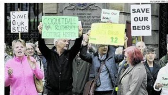
Protesters outside Morpeth Town Hall.

The outcome of yesterday's meeting sparked dismay and anger among the objectors, who afterwards issued a message of defiance to the decision-makers.